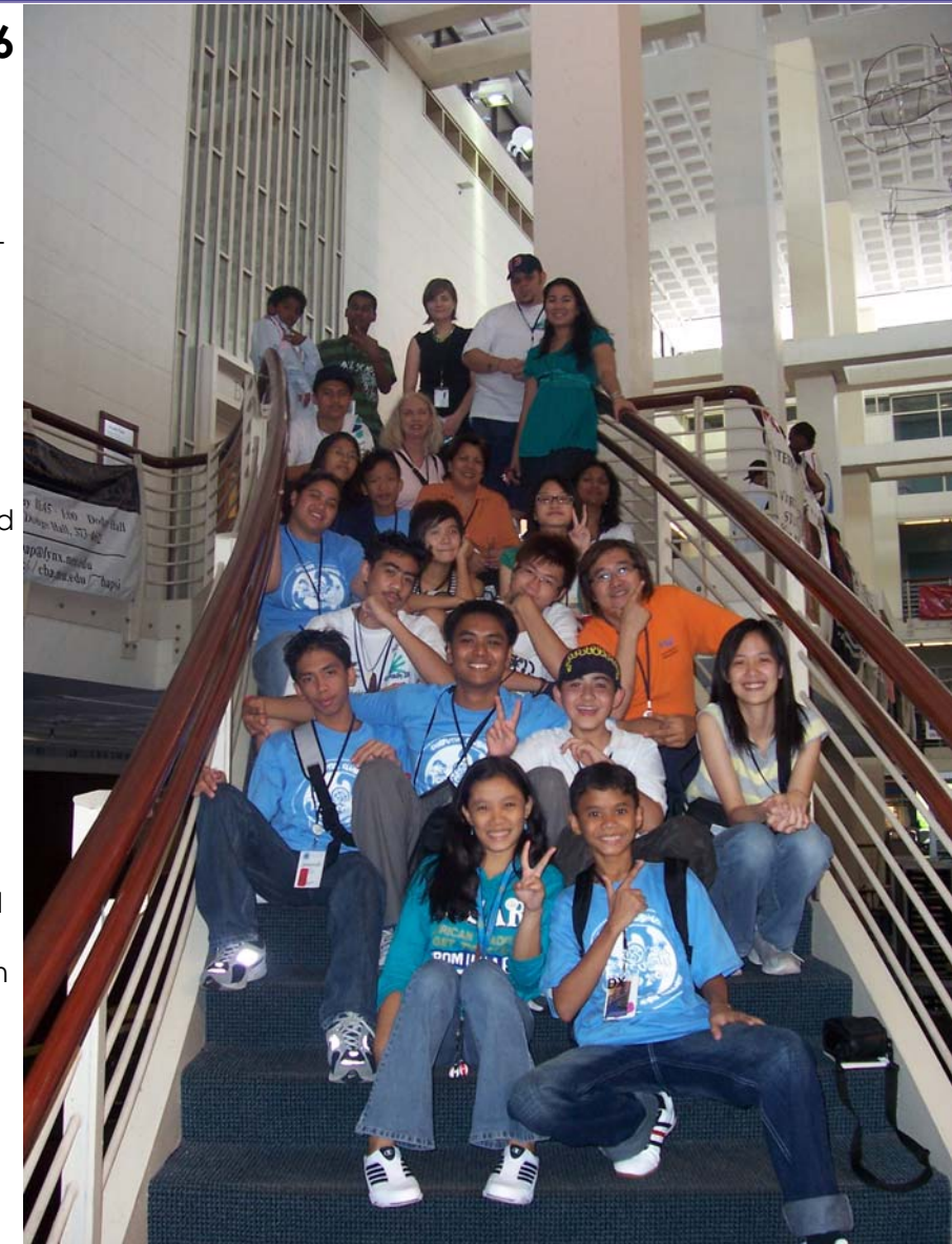
Asia Pacific Teen Summit Participants- members and coordinators from five clubhouses in the Asia Pacific region attended.

It was an unforgettable experience for everyone who took part and was only the beginning of friendships between young people in our countries that will last a long time.